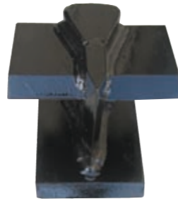
4-way Splitting Wedge