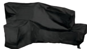
Log splitter Cover